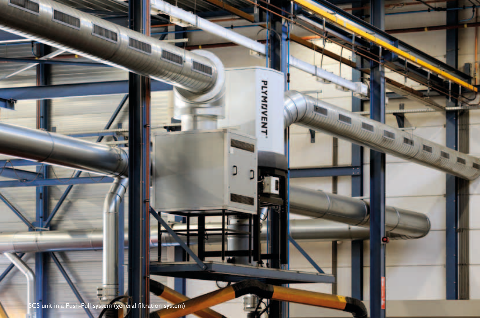
SCS unit in a Push-Pull system (general filtration system)