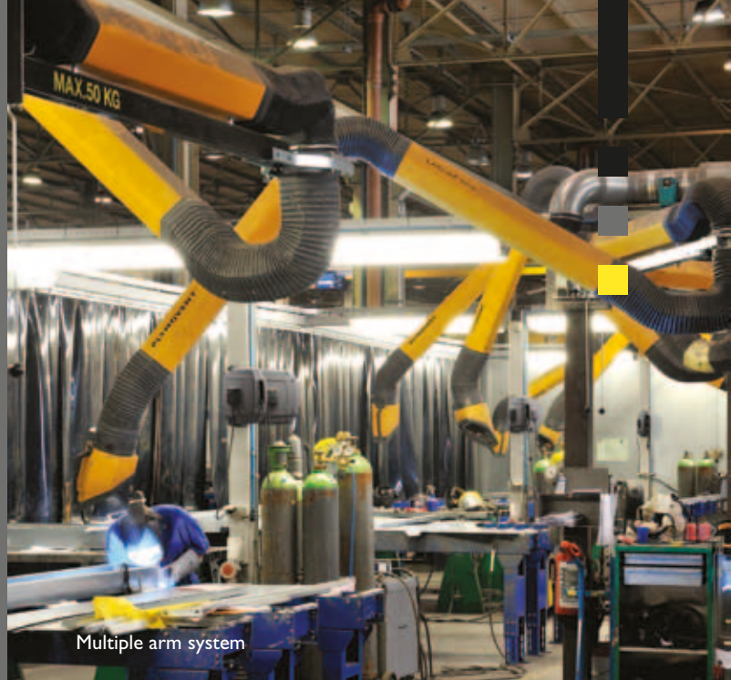
Multiple arm system

Plymovent is not just a manufacturer. We offer professional advice and engineering services to provide a solution tailored to your specific needs or requirements. In addition, we offer service and maintenance services to keep your system functioning optimally.