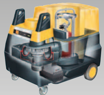
MFS with a self-cleaning system