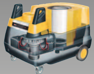
MFD with a disposable filter

Plymovent offers three models, each with its own benefits and unique characteristics. All filter units contain an aluminium spark arrester to remove sparks safely and quickly. Depending on your requirements, you can choose a model for light-to-moderate or intensive usage.