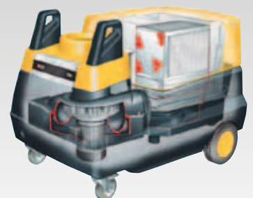
MFE with an electrostatic filter